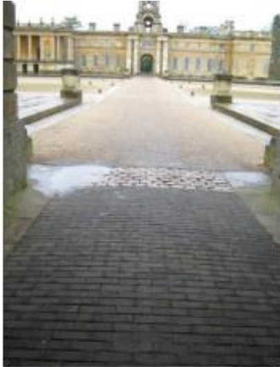
Example of uneven surface